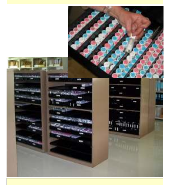
The specimens housed in the collection room.