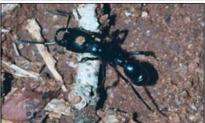
Ancylotrypa vryheidensis and its probable ant model, the African stink ant Pachycondyla tarsata

Defence posture of a large huntsman spider, Panaratel-la immaculata Lawrence, 1937 (Sparassidae)