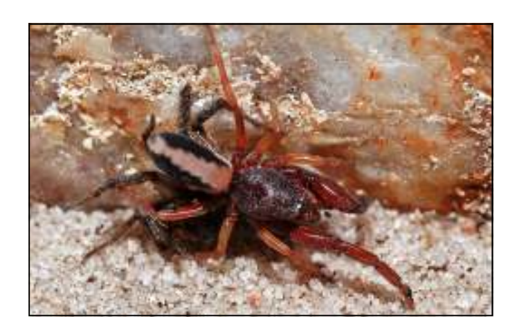
Diaphorocellus sp. with captured gnaphosid prey.