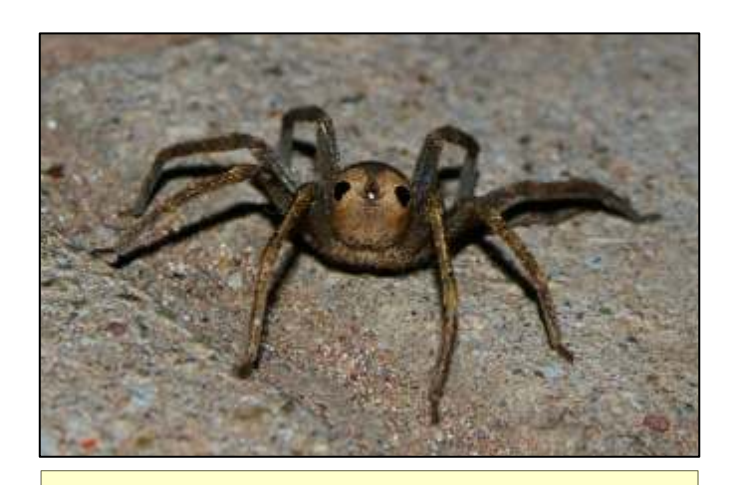
Panaratella immaculata defence posture, showing eyespots on its abdomen.