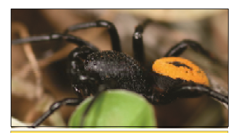
Psammorygma sp. (Zodariidae) photographed in Nwanedi-Luphephe Nature Reserve

Staff members and students from the Zoology Department set off on a two week invertebrate survey conducted at a large scale throughout the Vhembe region. This expedition formed part Colin Schoeman's research, a lecturer and PhD candidate at the University. His thesis will investigate invertebrate diversity and compositional turnover in the region. The sampling design includes replicated sites in representative vegetation types within the larger east-west climatic gradient in the region. This required a considerable sampling effort, ca. 800 pitfall traps left open over a 7 day period. Spiders are one of the groups Colin will focus on and the results should provide some insights into the scales at which ground-living spider diversity is generated. Sites included varied from dense Afromontane forests to arid regions with strong Kalahari elements.