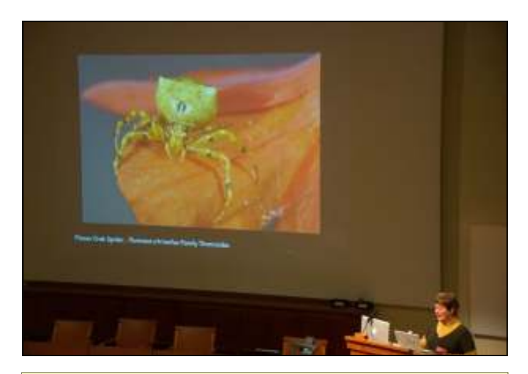
Astri Leroy opening the conference!

The conference was held in the Nobel Forum which has, up to now, been the hall in which votes are counted for the Nobel prizes in the various disciplines. The whole institute is being rebuilt - we were told that it is the largest building project at present underway in Europe - and this historic hall will be replaced soon, so we were thrilled to be there. The day before the conference we visited Linnaeus' summer house, preserved as a living museum with many of the fruit trees in the garden that he planted himself. For us this was all thrilling, goose bump stuff!