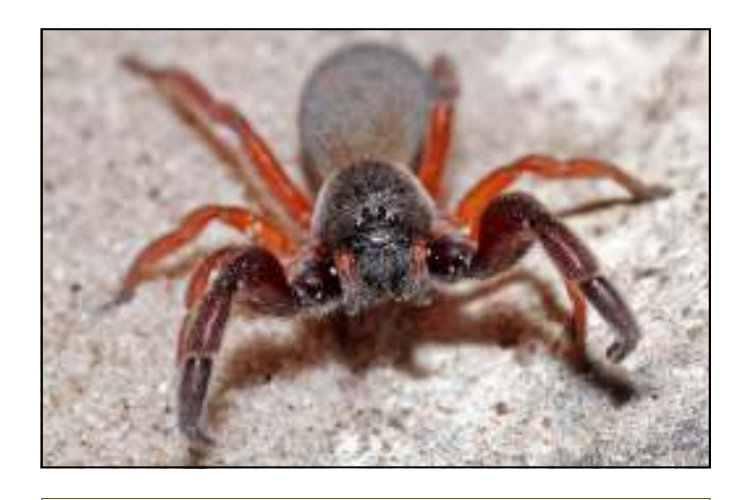
Palpimanus sp. from De Hoop Nature Reserve.