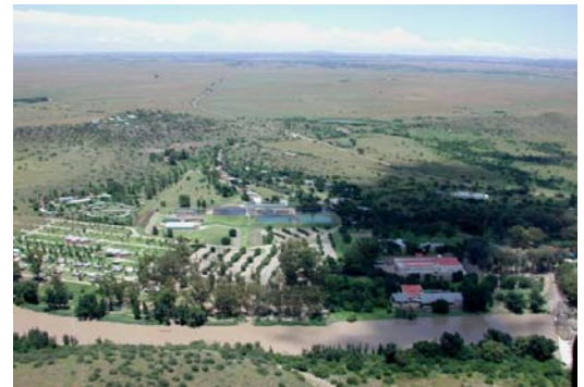
The Maselspoort Resort

For general information: http://www.nasmus.co.za/ARACHNOL/news.htm